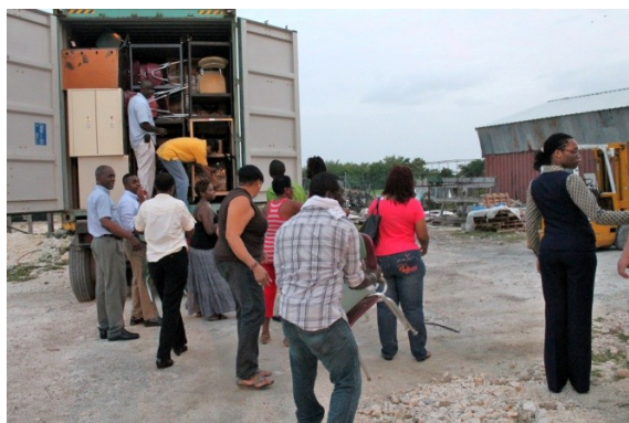
The Rotary Club of Savanna-La-Mar helped unload the container during Mission 1, Jamaica.