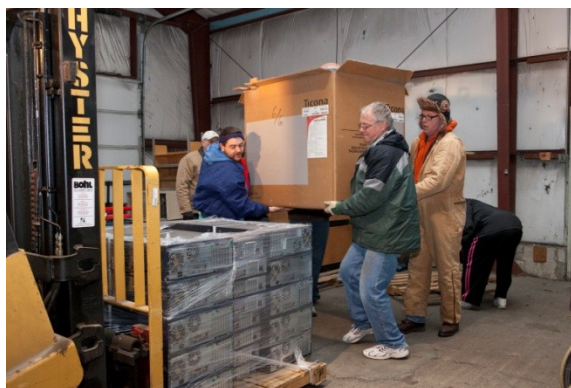
Loading a container at the MESA Findlay warehouse

All the equipment and supplies for a mission are collected and stored in the MESA Warehouse in Findlay, Ohio. Shipments are sent via container to Jamaica or Belize where everything is stored until the mission team arrives. Approximately 20 sites are set up during each mission.